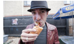
UMX at Bender's Tavern