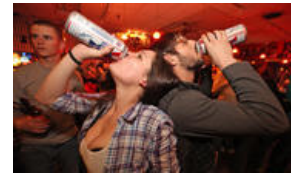
3 Kings Fifth Anniversary